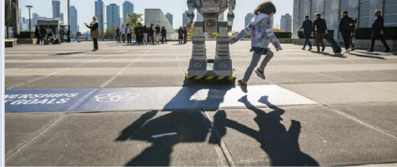
Killer Robots: UN Vote Should Spur Action on Treaty